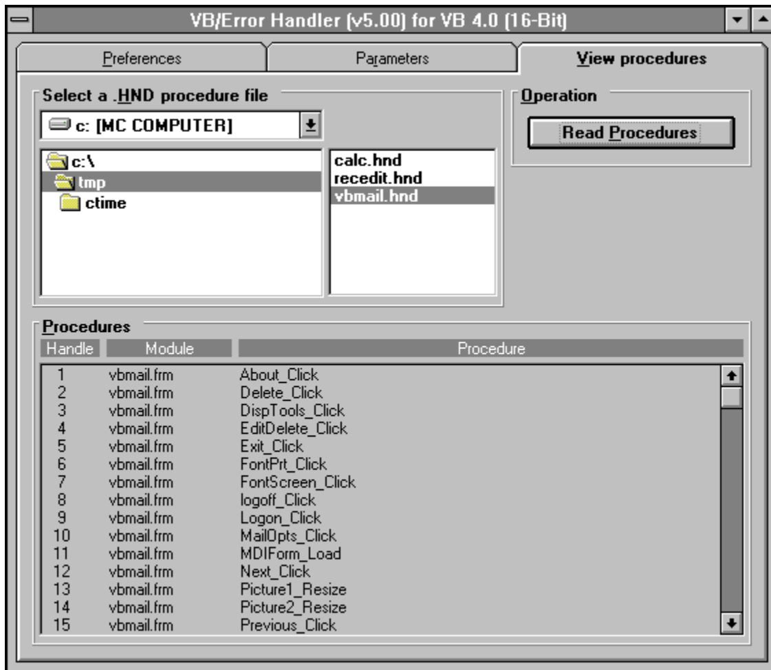
VB/Error Handler (16-Bit)